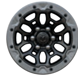
18-inch Beadlock-Capable Aluminum Optional (WS1)