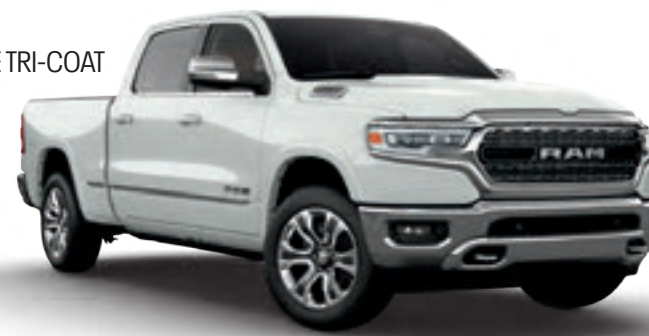
IVORY WHITE TRI-COAT