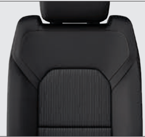
Cloth Bench—Black Optional