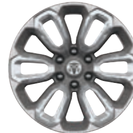
20-inch Aluminum with Premium Painted and Polished Inserts Included with Sport Appearance Package (WRJ)