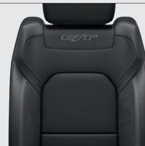
Leather-Trimmed Bucket—Black Included with G/T Package