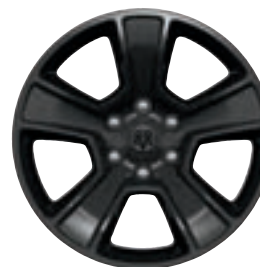
20-inch Black- Painted Aluminum Included with Night Edition (WRP)