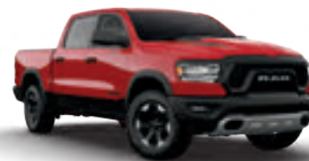
Rebel® shown in Flame Red with Diamond Black Crystal Pearl lower