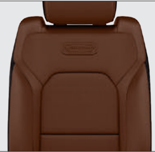
Premium Leather Bucket—Cattle Tan/Black Standard