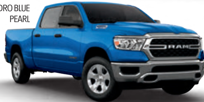
HYDRO BLUE PEARL