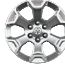
20-inch Chrome-Clad Aluminum Included with Sport Appearance Package (WRK)