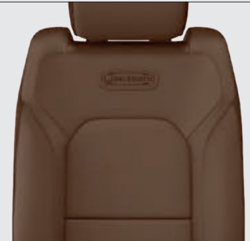
Premium Leather Bucket—Mountain Brown Included with Southfork Edition Group