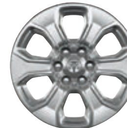
20-inch Premium Chrome-Clad Aluminum Optional (WRD)