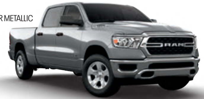
BILLET SILVER METALLIC