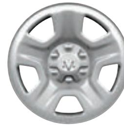
18-inch Steel Painted Standard (WBF)