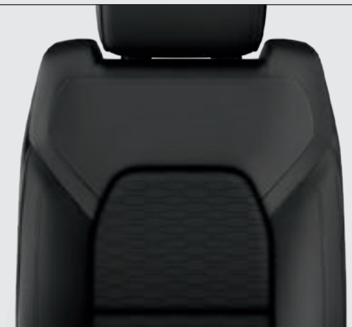
Vinyl with Cloth Inserts—Black Included with BackCountry Package