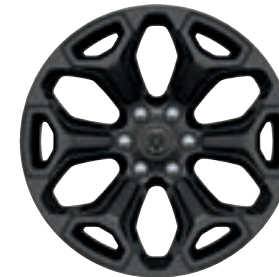
22-inch Black-Painted Aluminum Included with Night Edition (WP9)