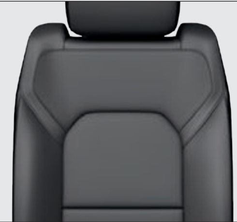
Vinyl Bench—Diesel Gray/Black Standard