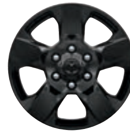
18-inch Black-Painted Aluminum Included with Warlock Package (WBP)