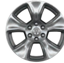
20-inch Premium Aluminum Painted/Polished Optional (WRB)