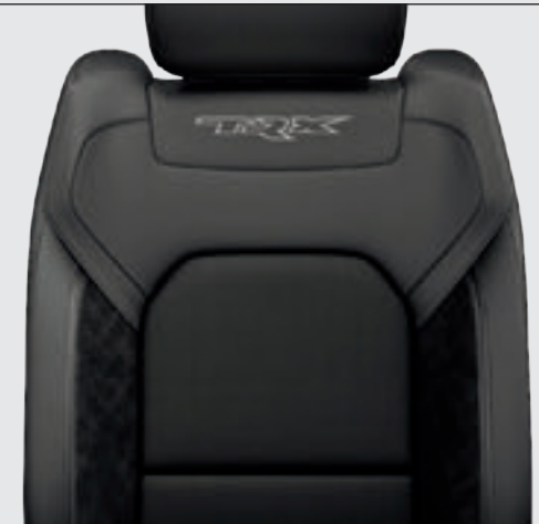
Premium Leather Bucket with Suede—Black with Gray accents Optional