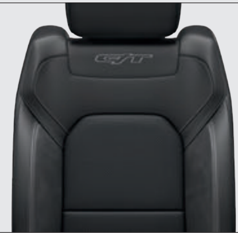
Leather-Trimmed Bucket—Black Included with G/T Package