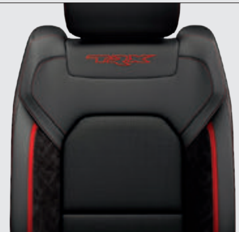
Premium Leather Bucket with Suede—Black with Red accents Optional