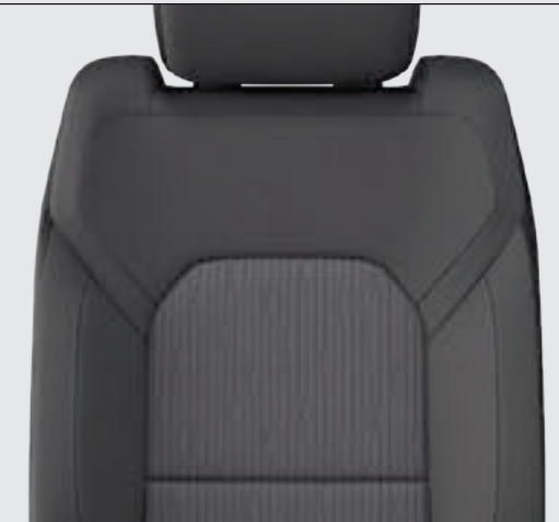
Cloth—Diesel Gray/Black Standard