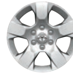
18-inch Painted Aluminum Included with Max Tow Package and Chrome Appearance Group (WBB)