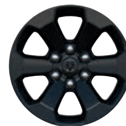
18-inch Gloss Black-Painted Aluminum Included with Night Edition (WBS)