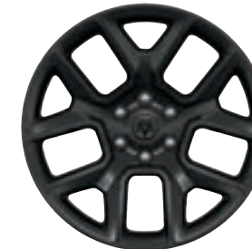
22-inch Black-Painted Aluminum Included with Night Edition Optional with Sport Appearance Package (WPH)