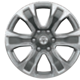
20-inch Premium Gray-Painted/ Polished Aluminum Standard (WRU)