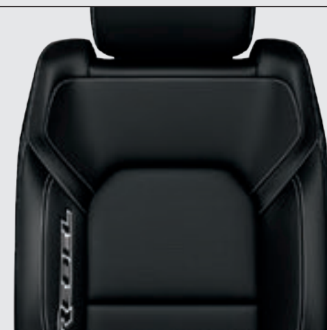
Leather-Trimmed Bucket—Black Optional