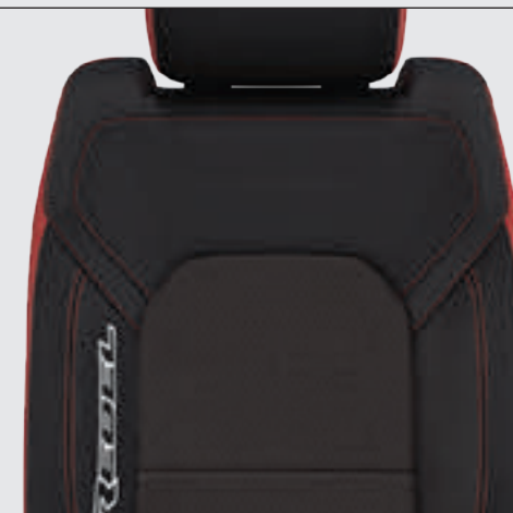
Vinyl/Cloth Bucket—Black/Dark Ruby Red Standard