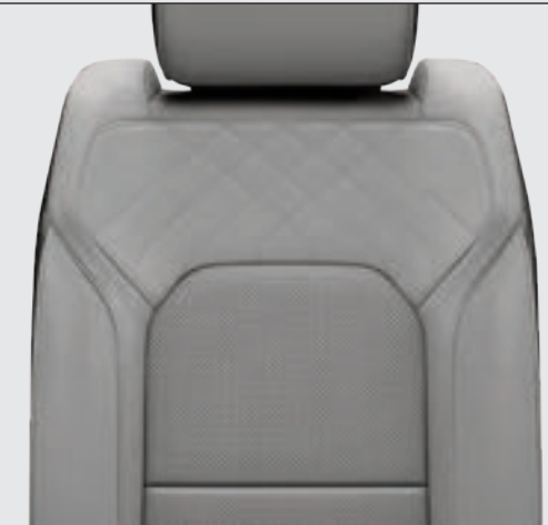
Premium Leather Quilted Bucket—Sea Salt/Indigo Included with Elite Package