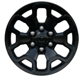
18-inch Black-Painted Aluminum Standard (WS4)