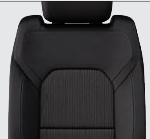
Cloth—Black Included with all-Black interior on Sport Appearance Package and Night Edition