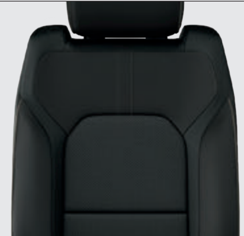
Premium Leather Bucket—Black Standard