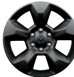
20-inch Black-Painted Aluminum Included with Night Edition (WRW)