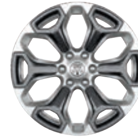
22-inch Premium Painted Aluminum Optional (WPZ)