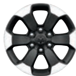
18-inch Black-Painted Aluminum/ Diamond-Cut Finish Standard (WBJ)