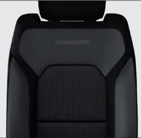
Leather-Trimmed with Perforated Inserts—Black Standard