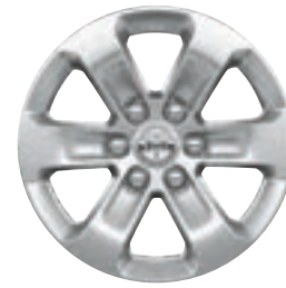
18-inch Cast Aluminum Standard (WBC)