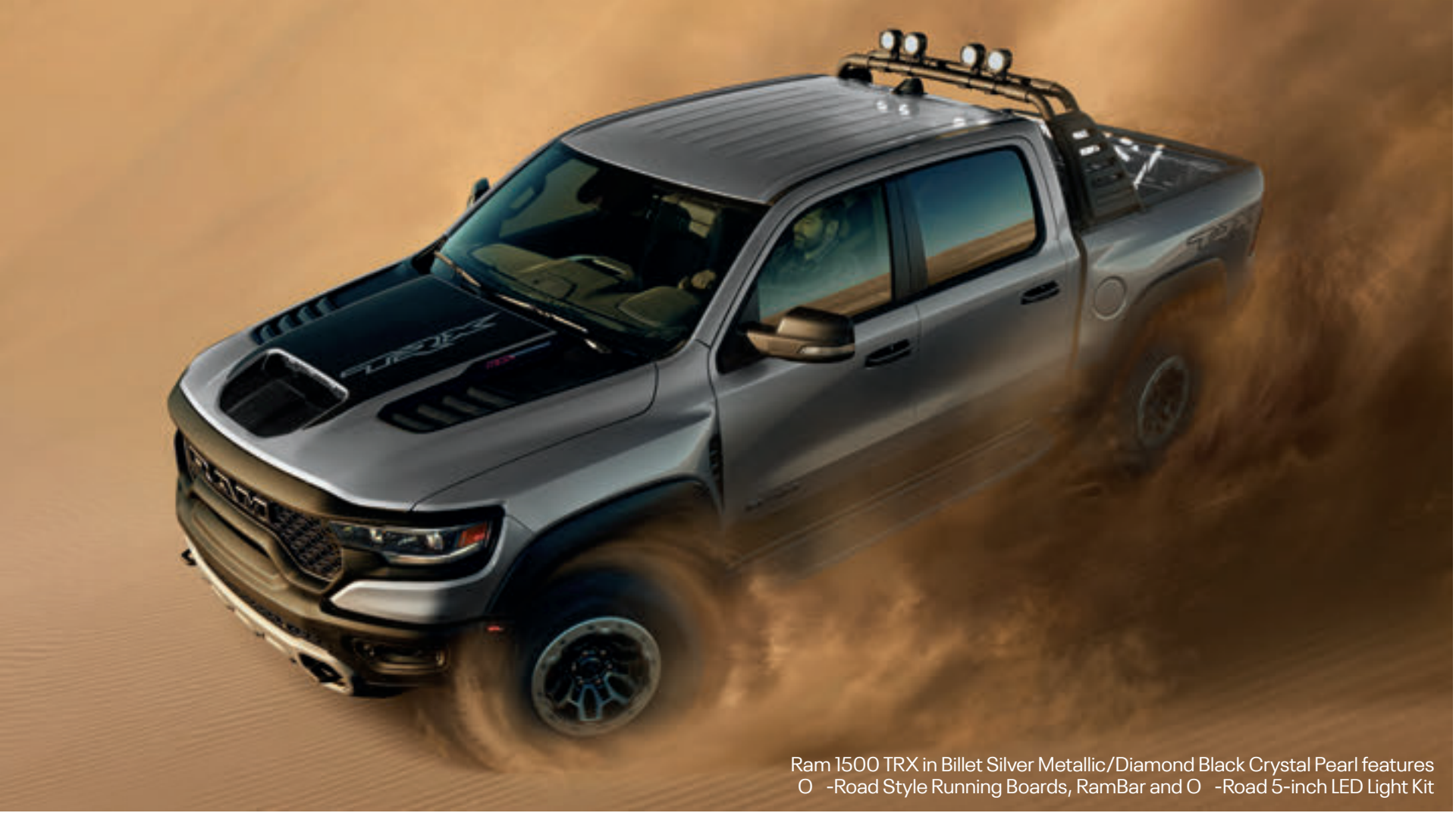
Ram 1500 TRX in Billet Silver Metallic/Diamond Black Crystal Pearl features Off-Road Style Running Boards, RamBar and Off-Road 5-inch LED Light Kit