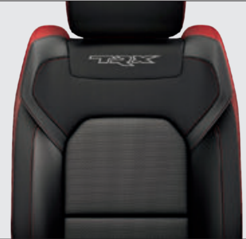
Vinyl/Cloth Bucket—Black/Red with Red accent stitching Standard